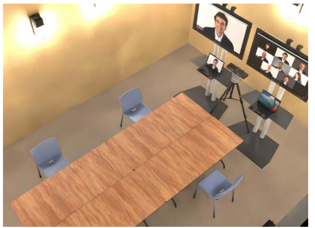
*Projectors, Screens, Monitors, Additional Mics etc. not reflected in pricing as the quantity required may vary based on customer/space requirements.

TO FACILITATE CLIENT PROVIDED PLATFORM (E.G. MICROSOFT TEAMS, ZOOM, ETC.)